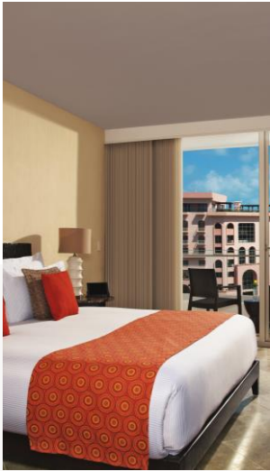
SIMPLE ROOM WITH PARTIAL SEA VIEW