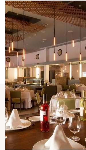
RESTAURANTS ALL INCLUSIVE