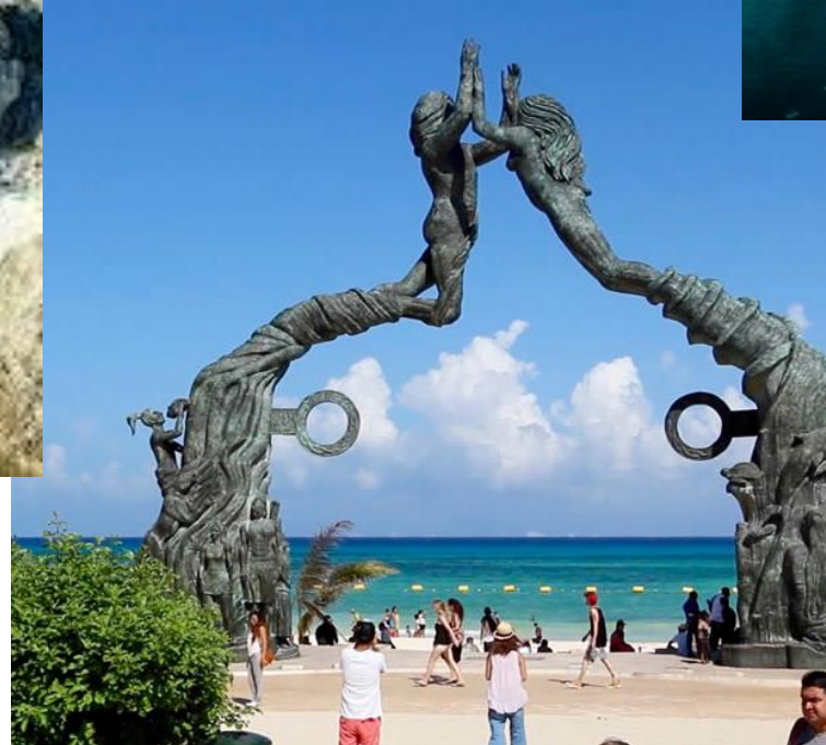
PLAYA DEL CARMEN